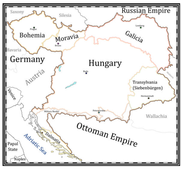
The Austrian Empire in 1850. The Eisners came from Bohemia, shown top left.