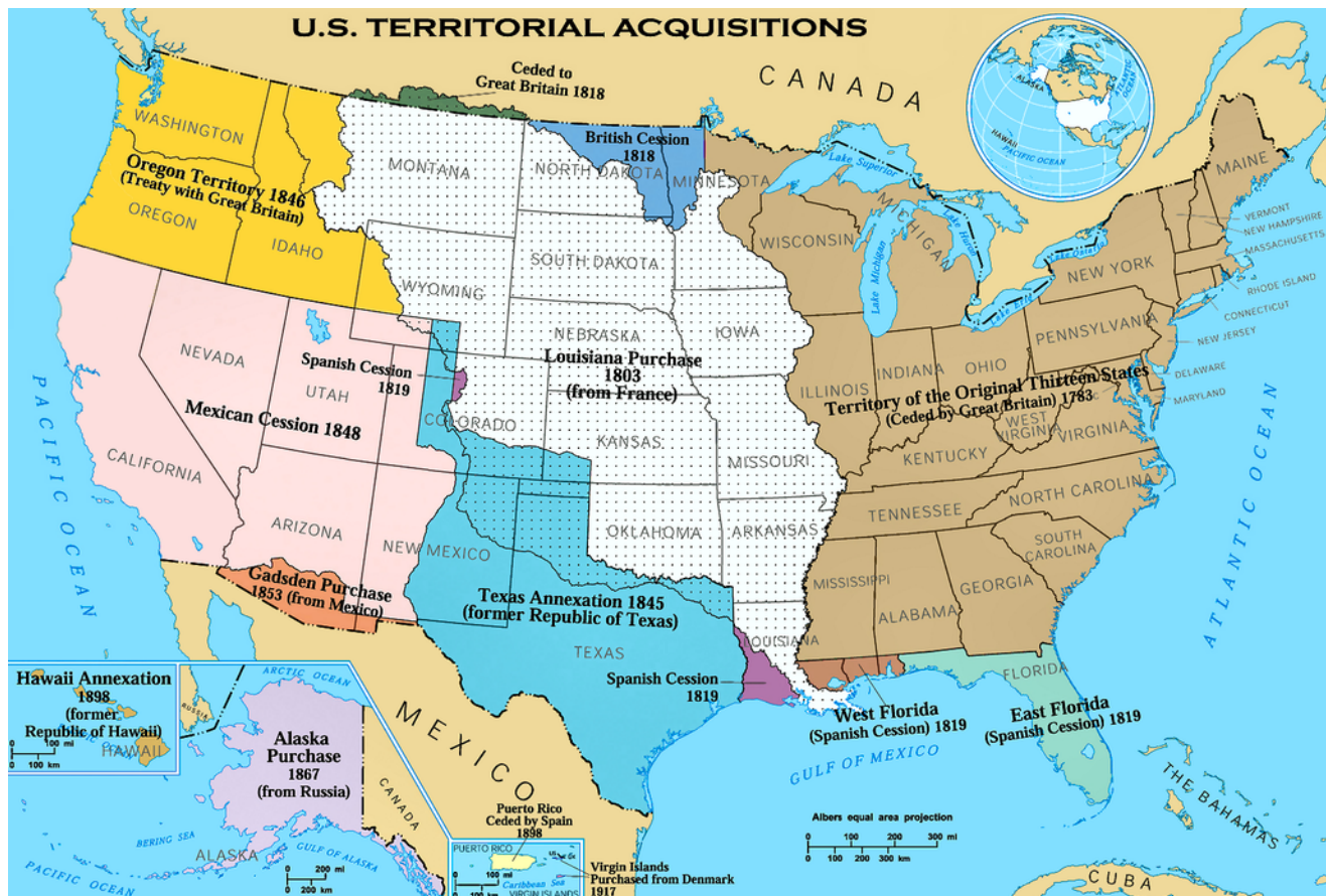
Map of US Territorial Acquisitions

Directions: Read the passage below and answer the question(s) that follow.